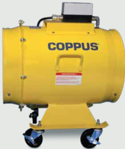
TA16 with optional caster kit

1 1/2-HP, 5,000 cfm (8,495 m 3 /hr) free air