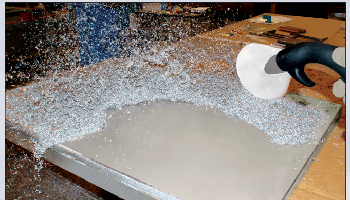
The Jet-Kleen is invaluable for cleaning production scrap and residue from all types of machinery, such as CNC stations and drill presses.

Many schools have industrial classes, such as wood shop, metal shop, ceramics and clay, plastics, etc. These classes routinely use compressed air to remove dirt, dust, powder and metal shavings off the students' clothing. With Jet-Kleen, debris removal is achieved without the use of dangerous compressed air, preventing injury.