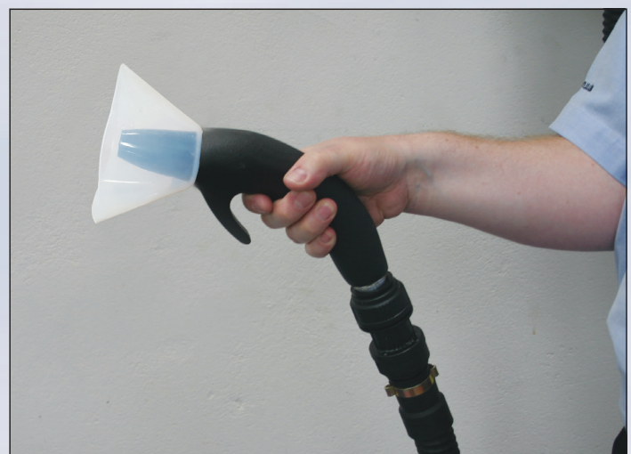
The Jet-Kleen, shown with standard chip guard attachment.

- Jim Parlin, Supervisor, Century Aluminum Corp.