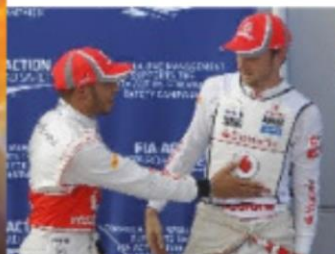
Lewis Hamilton, Jenson Button F1 Champions

Some of the best athletes in the world, and some of the most important First Responders on the planet!!!