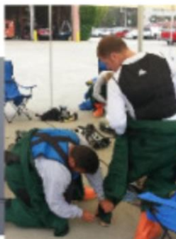
FEMA Crew Los Angeles Team