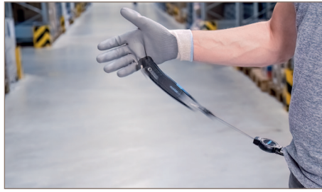
Knife at the moment of release.