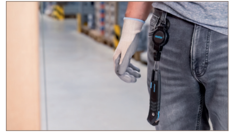
Knife at rest (without open blade).