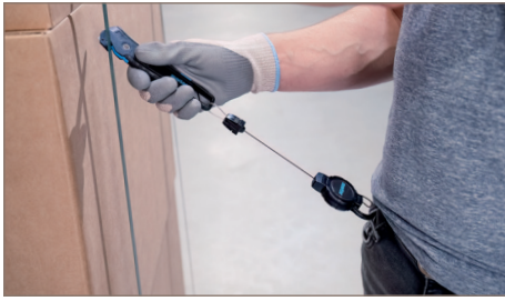
Knife in use.