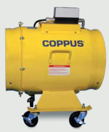
TA16 with optional caster kit

1 \frac{1}{2} -HP, 5,000 cfm (8,495 m3/hr) free air