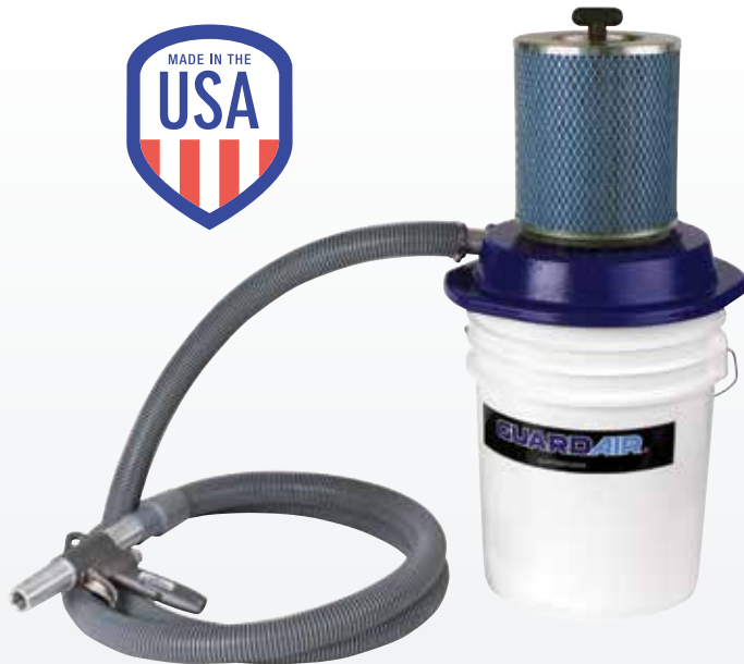
GunVac with Contain-It Kit Part Number: 1522

Designed for use with Guardair Models 1500, 1510 and 1548 GunVacs, the Contain-It Kit provides 5-gallons of storage capacity for vacuumed up debris. Ideal for collecting metal chips, shavings, sand, powders or sawdust. Features plastic pail with weighted lid for safe operation and easy emptying. Includes standard cartridge filter and 1-1/4" ID x 10' flexible vacuum hose. Hose cuff and hose clamp provide secure vacuum hose connections. Optional cloth filter bag provides added filter protection.