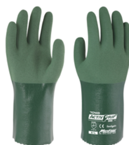
ActivGrip 566: 12 inch (30cm)