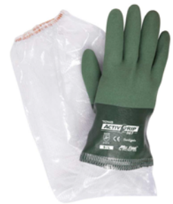
ActivGrip 567: 24 inch (60cm)

Comes with heat-sealed PVC sleeves, reinforced to prevent tears and punctures.